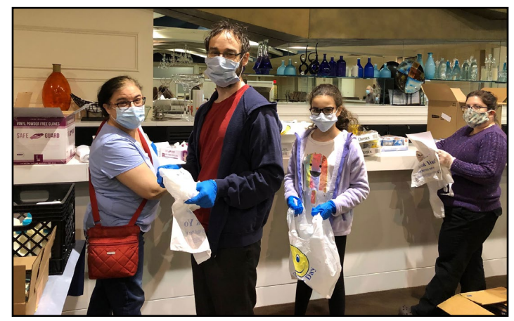
Temple Israel volunteers packaged groceries recently, preparing them for members who used the congregation's "Easy Pick Grocery Service."

Volunteers are needed to sort the groceries and prepare them for pick-up. For further information about the food service or to volunteer to prepare the orders for pick-up, contact Rabbi Schweber at rabbischweber@tign.org or 482-7800.