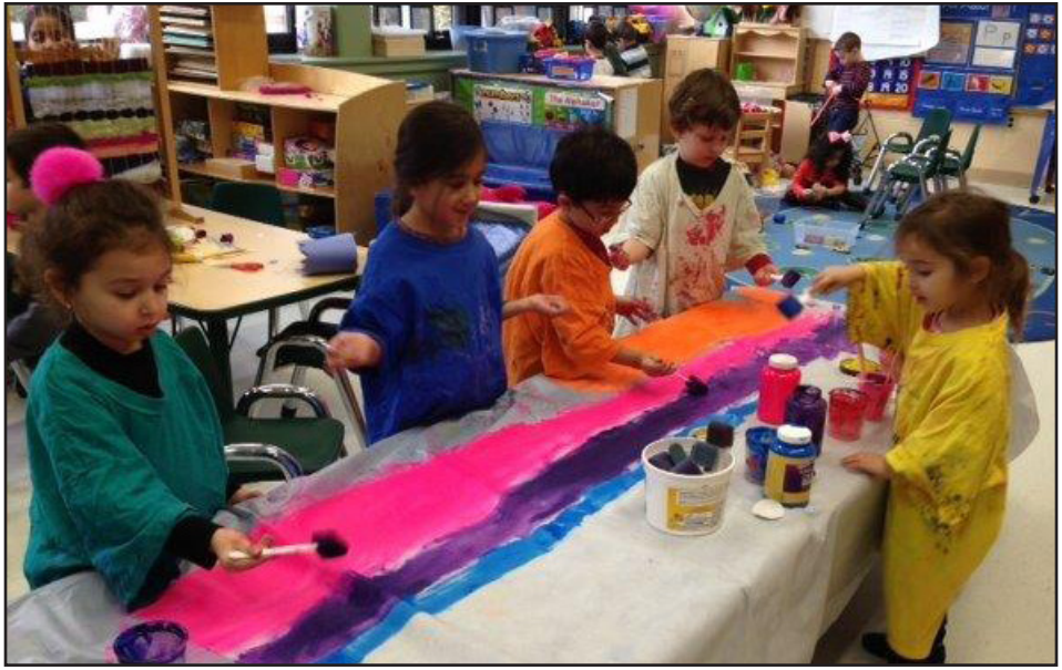
The Beth HaGan Dolphins class prepares Joseph's coat for their science project.

and weaving Joseph's coat. We have invited a spinner and a weaver to our event. They will bring their wheels and looms and give a demonstration. We are so excited to display our projects and share what we learned.