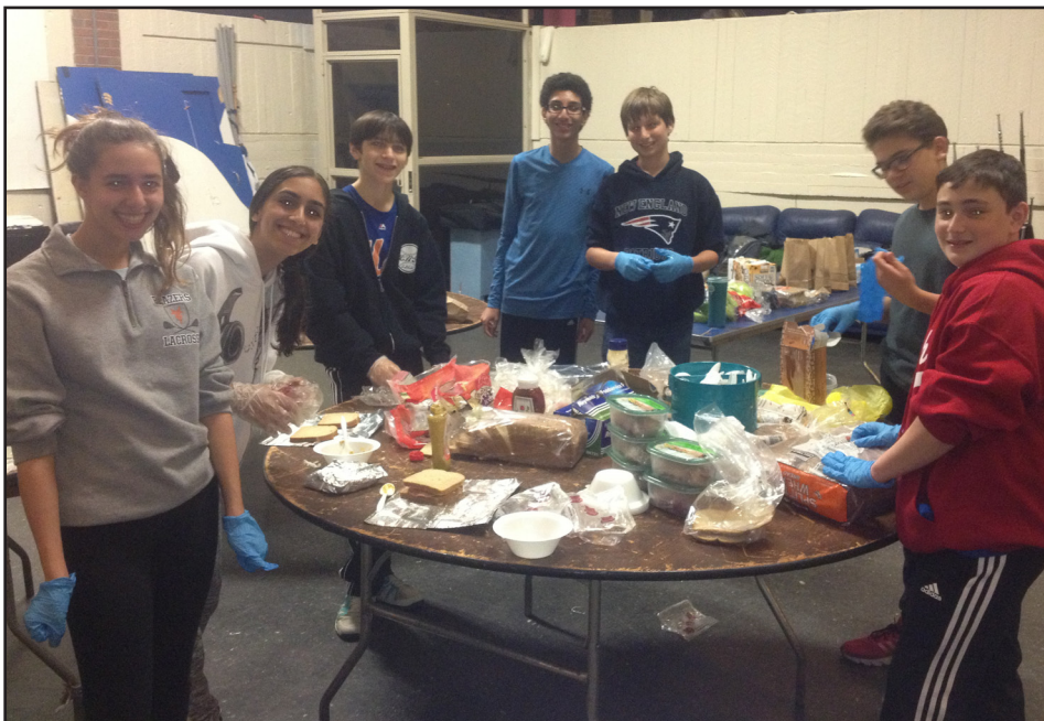
Waxman High School and Youth House ninth graders prepare food for another Temple Israel Midnight Run, bringing food and clothing to New York City's homeless.

Temple Israel's House Committee is looking for volunteers to assist with synagogue landscaping and beautification, including plantings around the grounds. To volunteer call the Temple Israel office at 482-7800.