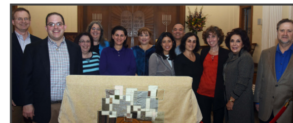
Temple Israel's latest adult Benei Mitzvah class preparing for their “graduation” with the clergy and their tutors.