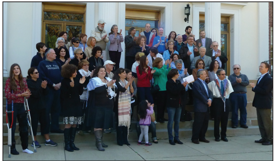
A large group of congregants from Temple Israel, Temple Beth-El and the Lake Success Jewish Center assembled, as a Flashmob on the front steps of Temple Israel, in support of Jewish pluralism in Israel.

The event culminated with a spontaneous and rousing rendition of "Am Yisrael Chai" ("The People of Israel Live") and a joyous hora in celebration of coming together as a community to participate in honor of a fervent love for Israel as the homeland for all Jews.