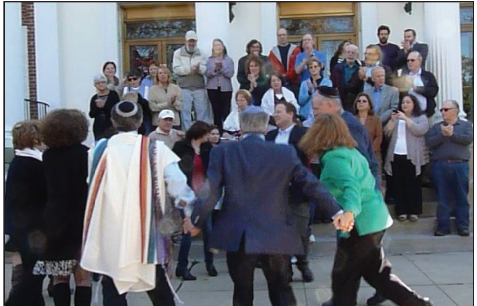
The rabbis of three area congregations led a hora at the front steps of Temple Israel as supporters of religious pluralism in Israel applauded.