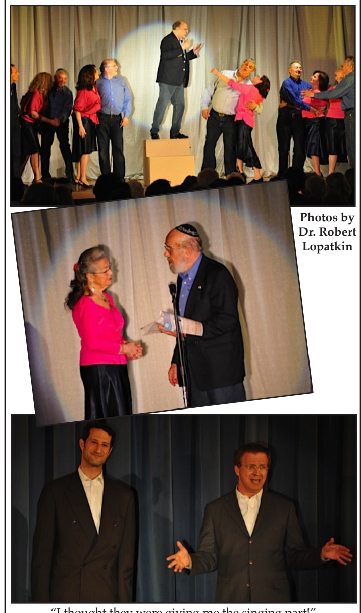
"I thought they were giving me the singing part!"

"Jewsical the Musical," the most recent production by the Temple Israel Players, had large crowds singing along to the many numbers made famous by Jewish singers, musicians or lyricists. The show highlighted the musical talents of a large cast of congregants.