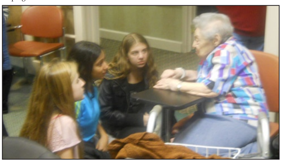
Waxman High School and Youth House teens worked with area senior citizens.

It was obviously difficult for a group of 7th graders to spend a semester learning about the most horrifying time in Jewish history. Our students maturely and intelligently studied the Holocaust as Jews, and they commemorated the catastrophe by leading a ceremony for their parents and the rest of the Youth House on Thursday, April 19. The ceremony was a collection of reflections on their semester and other selected readings. Each student honored someone who passed away by saying a few words about a person from their family or someone they researched before saying Kaddish. Six students told their family's story of sur--Continued on page 5