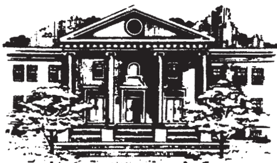
Exhibit On Ghetto Life Coming to Temple Israel On Loan From New York's Museum of Jewish Heritage In April