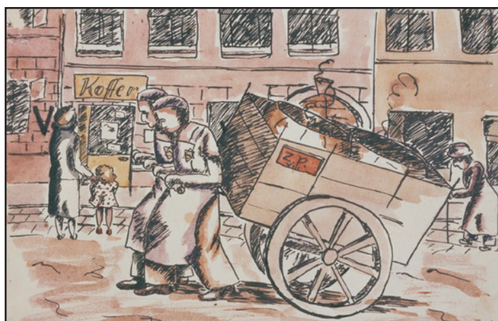
A young girl's sketch of a ghetto food cart, part of a Holocaust exhibit coming to Temple Israel in April, for the congregation's marking of Yom HaShoah.

Two traveling exhibits from New York's Museum of Jewish Heritage are coming to Temple Israel for a week in early April.