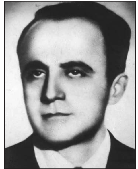
Warsaw historian Emanuel Ringelblum

Next time you have the chance to learn, sing or act with enthusiasm, for your own sake or for the sake of others, ask yourself the following question: What's stopping me? Or, if you prefer: What would Dr. Ruth do?