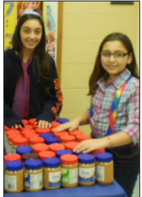
School food collection, above and below, is part of the holiday observance.

Never underestimate the power of song! From "Ma Nishtana" to "Avadim Hayinu," our children enthusiastically sing the Haggadah. We firmly believe in the power of creating strong Jewish memories. For many of us, seder memories are among the most powerful of our childhood. Pesach songs have the power to stir emotions, thoughts