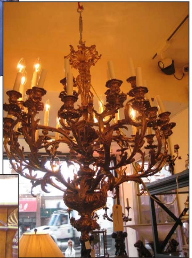
Above: 18th Century Two Tier Heavy Bronze Chandelier with 30 Lights