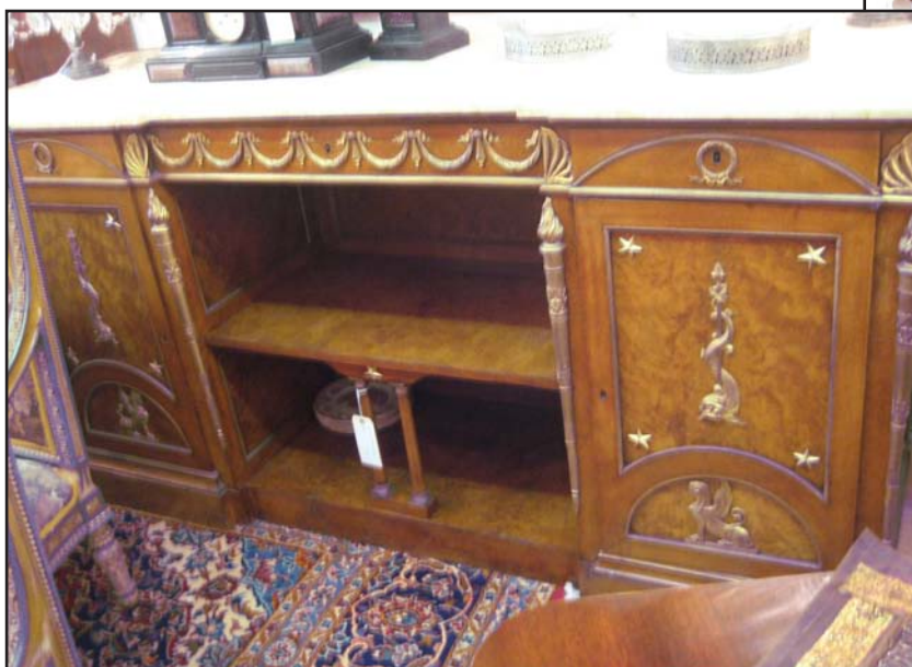
At Left: French Empire Server with Marble Top