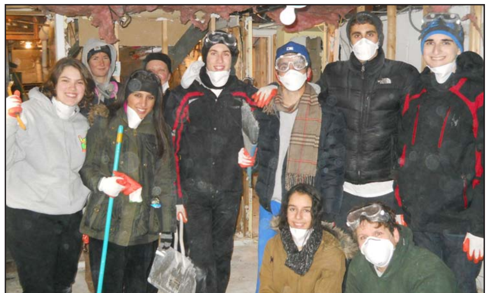
Youth House students cleared an entire Long Beach basement.