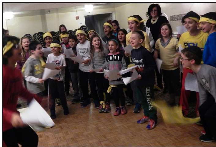
The Religious School's Color Warriors

We also included a mitzvah component to the Maccabiah: the youngest children decorated refuah sheleymah , "get well soon" cards; and they all signed them, "From the children of Temple Israel." These cards will be laminated and our clergy will bring them on hospital visits.