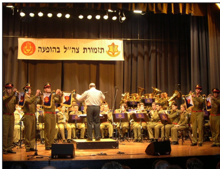
The IDF Orchestra in a recent concert.